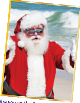
Are you on the list for Storytime?

Santa on social media brought to you by EYEOI