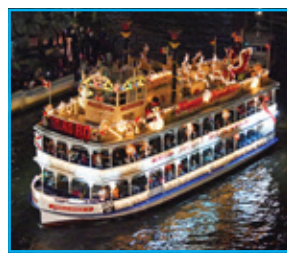
amazon Santa Showboat