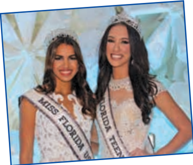
Miss Florida USA and Miss Florida Teen USA