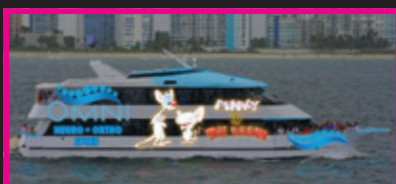
OMNI Orthopedic & Spine Center Showboat