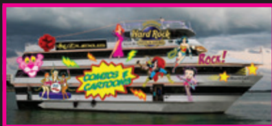
Grand Marshal Showboat presented by JM Lexus