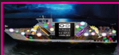
Republic National Distributing Company Showboat