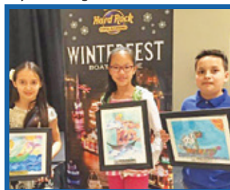
Artwork from 2015 participants