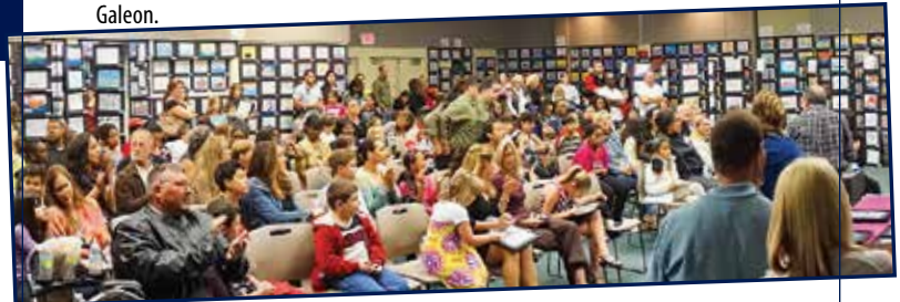
Artwork from 2014 participants

Enjoy a gallery showing and winner's reception at the Galleria Fort Lauderdale in March. All participants will receive tickets to the South Florida Fair and the tall ship – El Galeon.