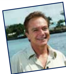
David Cassidy Partridge Family Boat