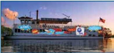
Jr. Captain powered by FPL