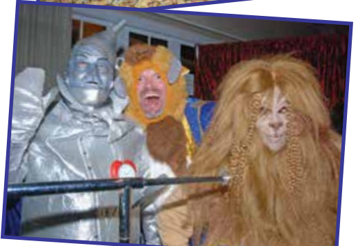
Celebrating the 2015 theme "Fairy Tales Afloat" (above) 2015 Board and Advisory members during a recent retreat (right)

The countdown has started for the Greatest Show on H<sub>2</sub>0: the Seminole Hard Rock Winterfest Boat Parade. Kick off the holiday season Lauderdale-style with boats large and small decked out with lights and music entertaining one million spectators along the 12-mile waterway route.