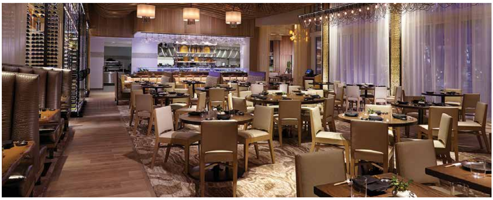
KURO at the Seminole Hard Rock Hotel & Casino