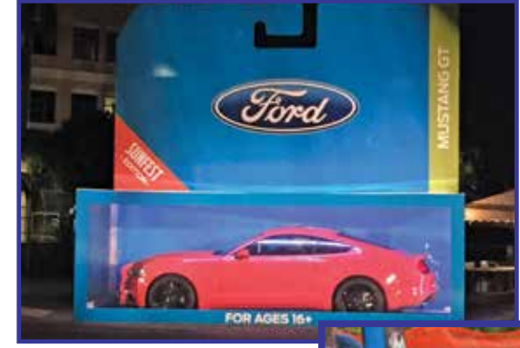
See this Parade Entry and Vote to Win Airline Tickets

Reminder: The Parade will go on rain or shine and there are no refunds. No pets, cans, or coolers are permitted inside the gated Grandstand area.